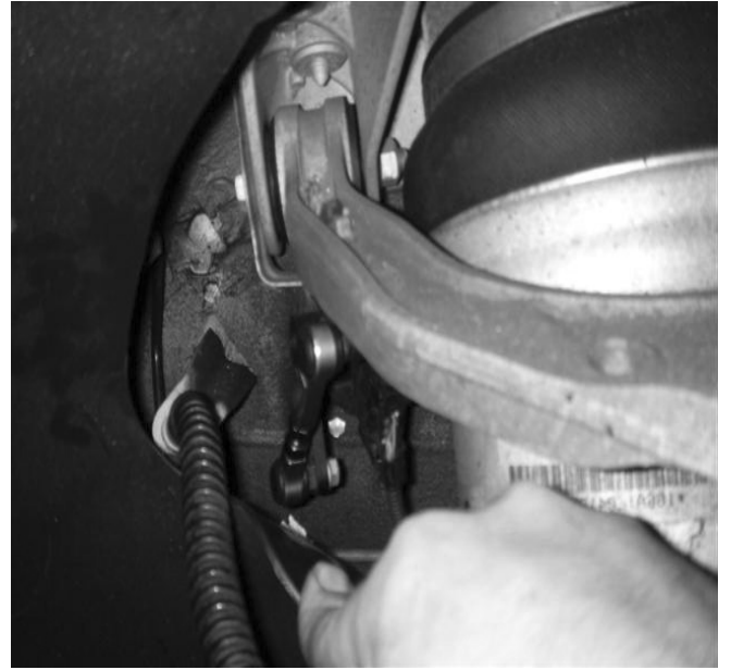
Adjustable Link installed