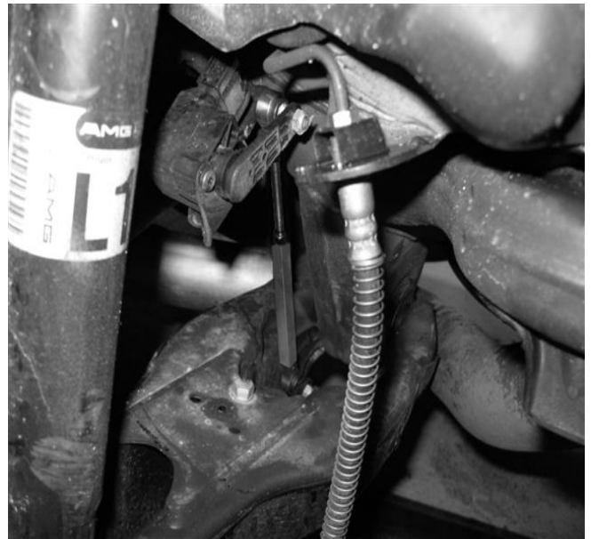
Rear Adjustable Link installed