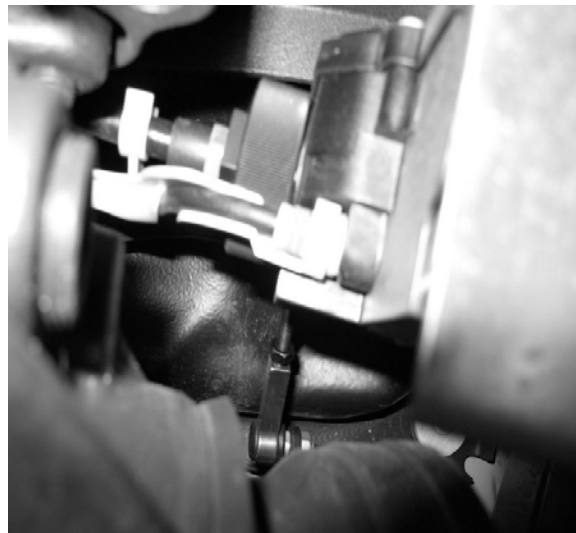
Adjustable Link installed