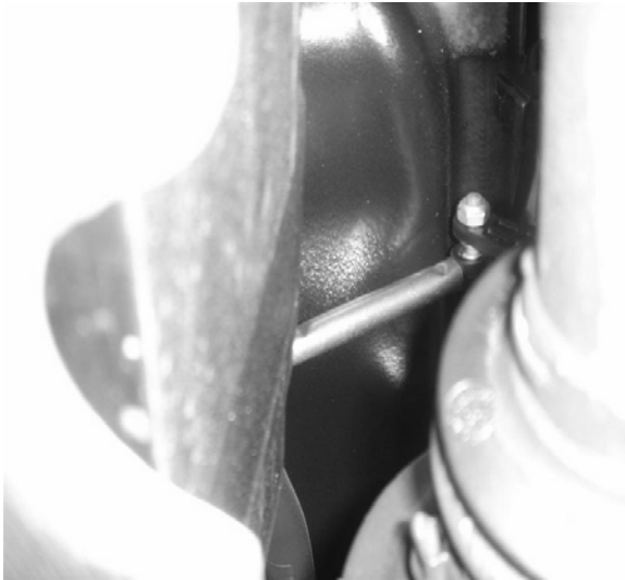
Rear Stock Link