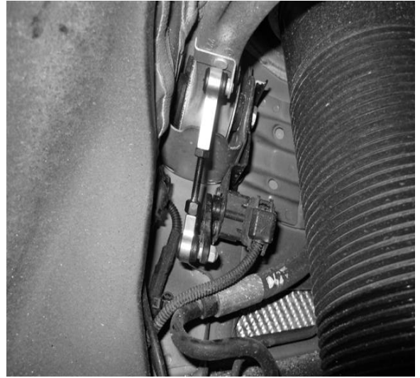
Front Adjustable Link Installed