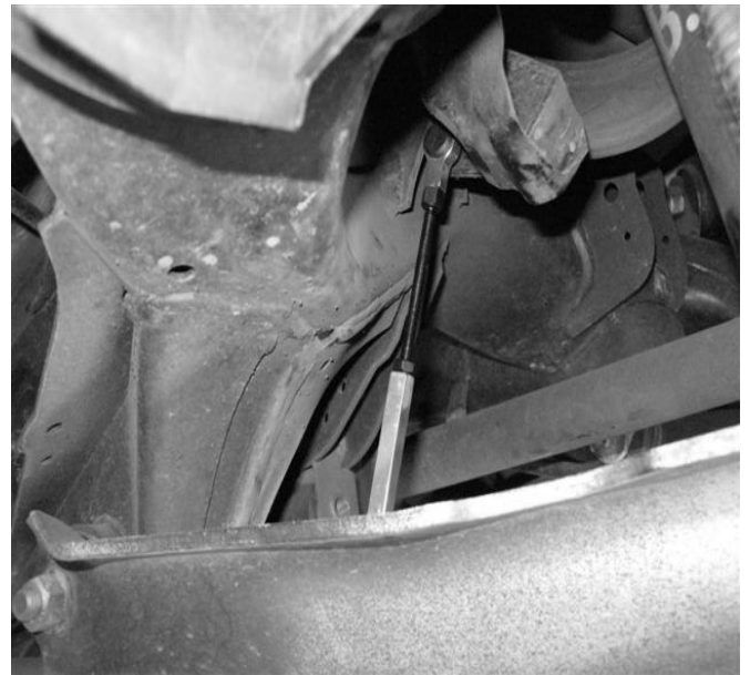
Rear Adjustable Link installed