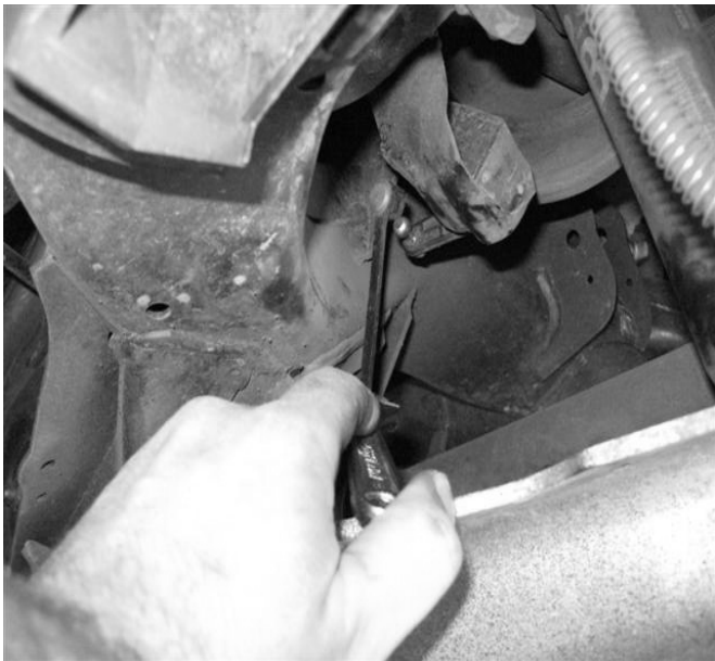
Rear Stock Link removal