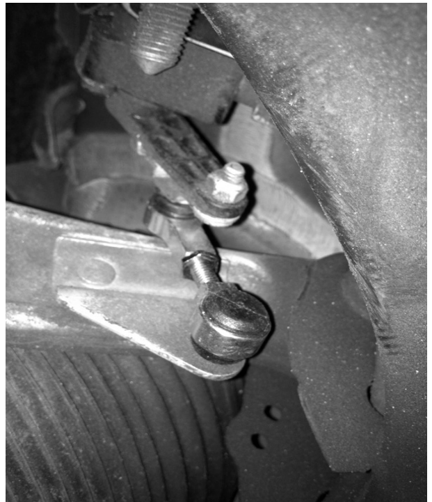
Rear Adjustable Link