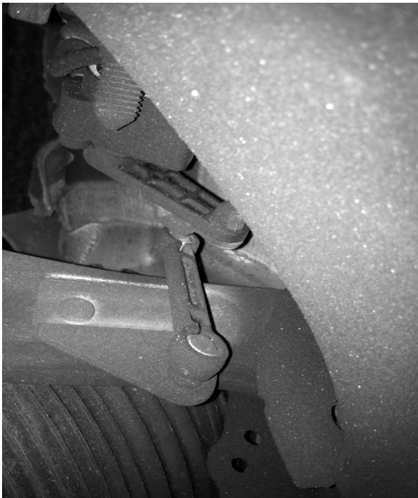
Rear Stock Link