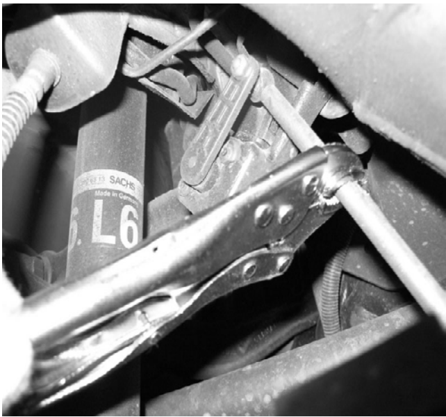
Rear Stock Link removal