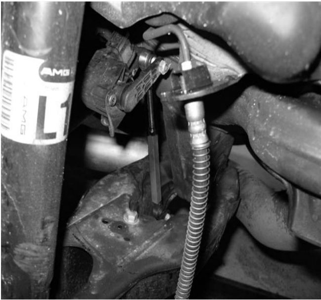
Rear Adjustable Link installed